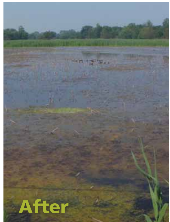
Figure 5: A study site at MacLean's Marsh, using 5% glyphosate. Before: Pre-treatment, 2007. After: Post-treatment, 2008. Note: There was no standing water in this area at the time of treatment.