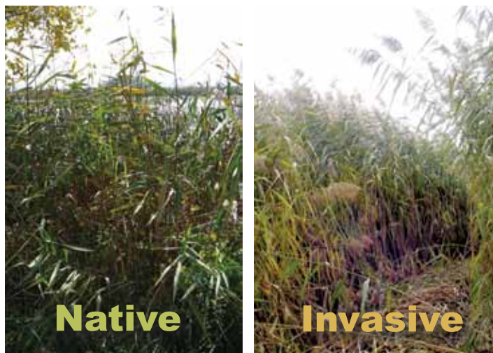
Figure 1: A native Phragmites stand (left) and an invasive Phragmites stand (right). Note the varied vegetation and lower density of native Phragmites stalks on the left and the taller, higher density invasive Phragmites stalks on the right.

Invasive Phragmites is a non-native plant that creates monoculture stands, which, in most cases, leads to a decrease in biodiversity and a destruction of habitat for other species, including SAR. In Ontario, invasive Phragmites has been identified across the southern part of the province, with scattered occurrences as far north as Georgian Bay and Lake Superior. The Ontario Ministry