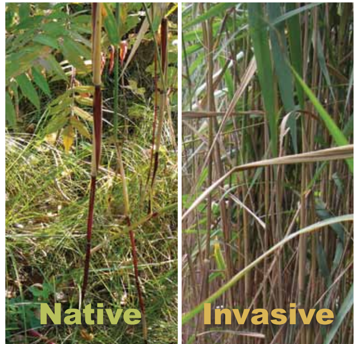
Figure 2: A native Phragmites stem (left) and an invasive Phragmites stem (right). Note the reddish brown native stem on the left, and the tan/beige invasive stem on the right.

Native stand photo courtesy of Erin Sanders, MNR. Invasive stand photo courtesy of Janice Gilbert, MNR.