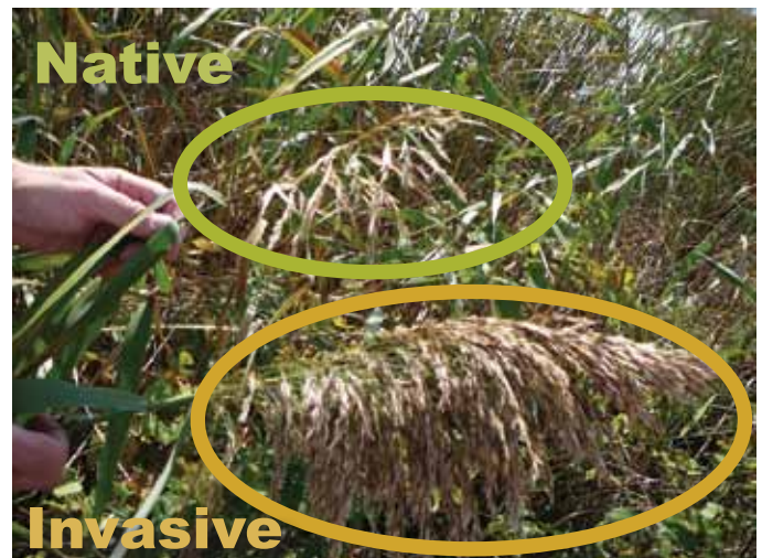
Figure 4: A native Phragmites seedhead (top) and an invasive Phragmites seedhead (bottom). Note that the native Phragmites seedhead is smaller and sparser compared to that of the invasive Phragmites .